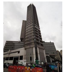
30+ Storey City Centre Hotel

The aims & objectives of day 1 are to ensure knowledge and understanding of the legislative requirements for demolition & refurbishment with demolition covering CDM 2015, L153 & PD/PC roles, and Building Act 1984 etc. How SKTE (Skills Knowledge Training & Experience) and organisation capability assessments are examined and measured. Explains how BS 6187: 2011 Code of practice for full and partial demolition is applied & demystifying the 20 clauses and the 6 annexes. Demolition organisations & training schemes (NFDC / NDTG / IDE etc) are explained.